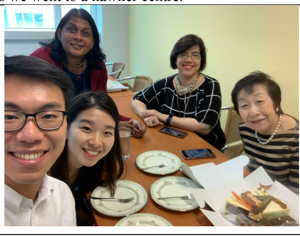
Tea-time with the staff in the pantry.