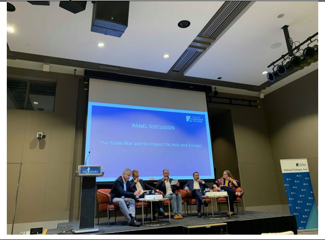
Attending a conference and panel discussion on "Trade and Economic Connectivity in the Age of Uncertainty" organized by Konrad Adenauer Stiftung.