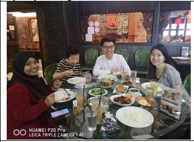
PECC staff brought us to another authetic Indonesian restaurant.