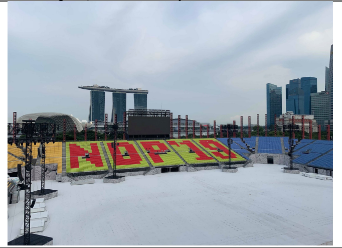
Walking around Singapore to witness the Singapore National day.