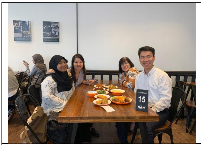
PECC staff brought us to a wonderful Indonesian restaurant