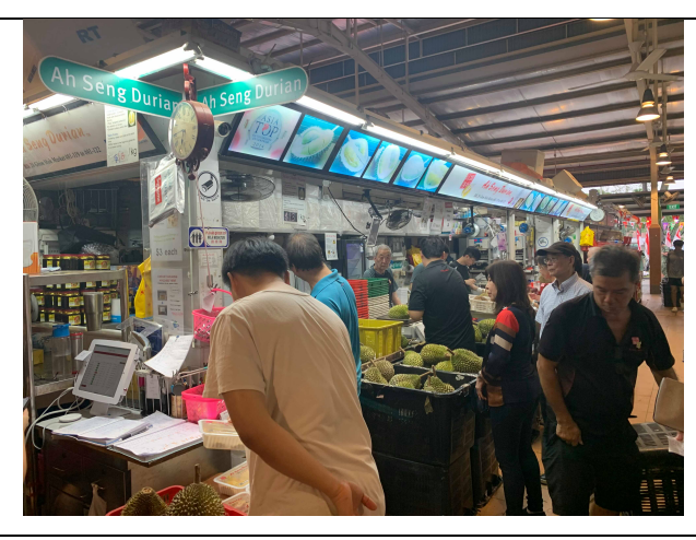
PECC staff hosting a "durian party" for the interns as we went to a hawker centre.